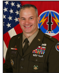
Brigadier General Steven P. Carpenter

Multi-Domain Command - Europe (MDC-E) plans, integrates, executes, and assesses long-range precision fires and multi-domain effects for U.S. Army Europe and Africa to destroy enemy A2AD capabilities and disrupt ground forces. In support of theater objectives, MDC-E synchronizes targeting to employ Army lethal and non-lethal fires and effects for land forces to achieve overmatch against any adversary.